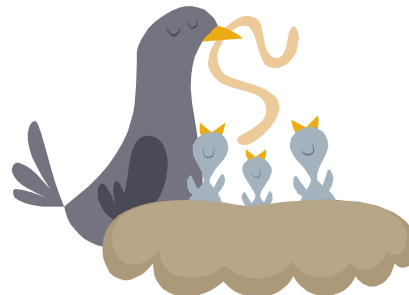
The Early Bird ...

Registration starts February 21, 2018 Register by March 31, 2018 for a Special offer*!