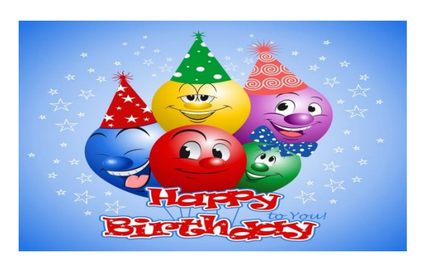
Students 14<sup>th</sup>-Harry Hitchcock 22<sup>nd</sup>-Jack Thurber 27<sup>th</sup>-Scout McKenzie