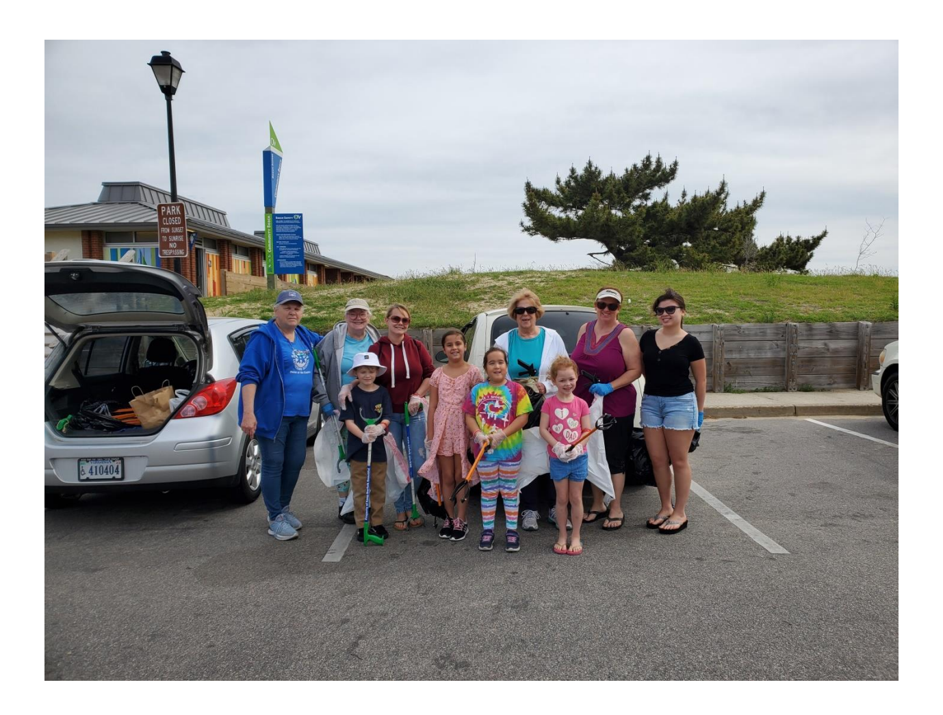
The starting group prepared to attack the trash!

We did our annual Clean the Bay on Earth Day, the 22<sup>nd</sup>. This year we grouped with the "Keep Norfolk Beautiful" project and we were able to get materials that were helpful. Plastic bags, gloves, and pickups that the students enjoyed using! We had a nice turnout and were able to help clean our local community beach park.